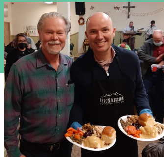
Gov. Spencer Cox serves at our Thanksgiving Banquet last year.

Please give as you are able as we prepare to serve thousands of meals through the Thanksgiving Season. Please give by using the envelope included with this newsletter or call our finance office at 801.746.1006 for secure credit card donations over the phone. You can also visit RescueSaltLake.org to donate online. Thank you for helping to change lives this Thanksgiving season!