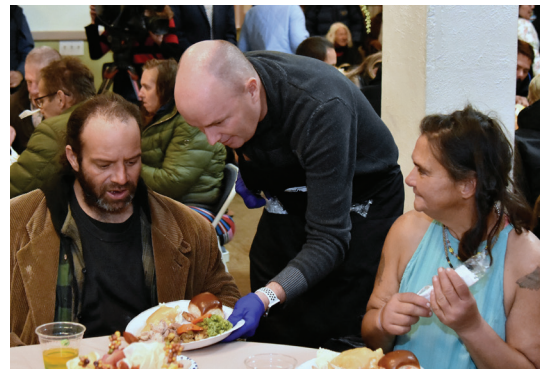
Top: A father and daughter share a Thanksgiving meal together at the Rescue Mission's Banquet.